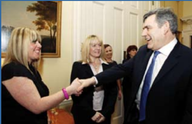
Prime Minister thanks the Front line 27 March 2009

MCF was fortunate to be invited to an event at No.10 Downing Street, in recognition of our achievements in the community.